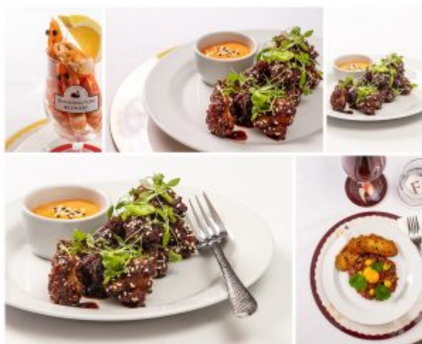
richardbudd | GREAT FOODS AND DRINKS PHOTOGRAPHY