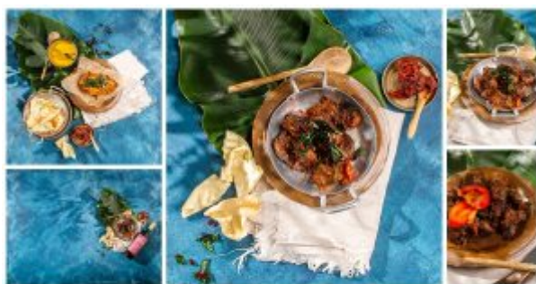
richardbudd | BEST FOOD AND DRINK PHOTOGRAPHER