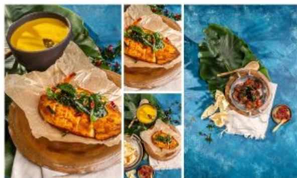
richardbudd | BEST FOOD AND DRINK PHOTOGRAPHER