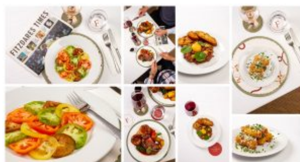
richardbudd | GREAT FOODS AND DRINKS PHOTOGRAPHY