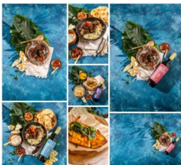
richardbudd | BEST FOOD AND DRINK PHOTOGRAPHY

A Culinary Journey: My collaboration with The White Pepper has