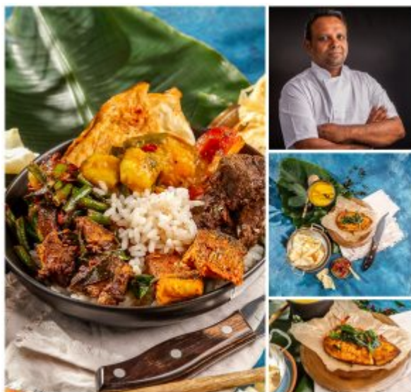
richardbudd | BEST FOOD AND DRINK PHOTOGRAPHER

opportunity to share my knowledge and contribute to their social media marketing efforts.