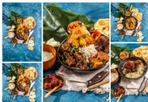
richardbudd | BEST FOOD AND DRINK PHOTOGRAPHER