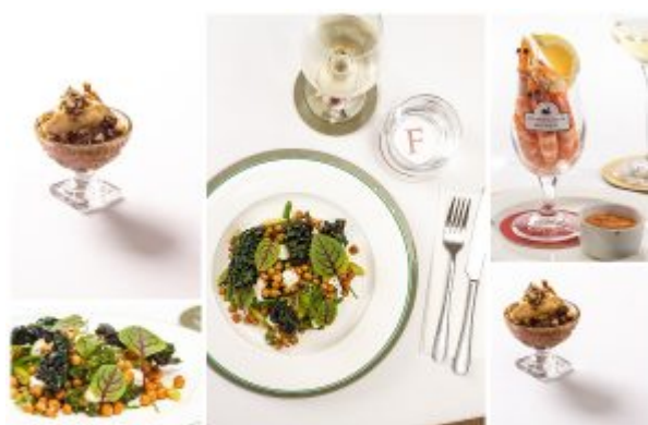
richardbudd | GREAT FOODS AND DRINKS PHOTOGRAPHY