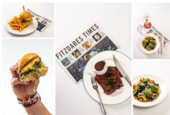
richardbudd | GREAT FOODS AND DRINKS PHOTOGRAPHY

We set to capturing the new food menu with some simply styled imagery, for the website and social feeds.